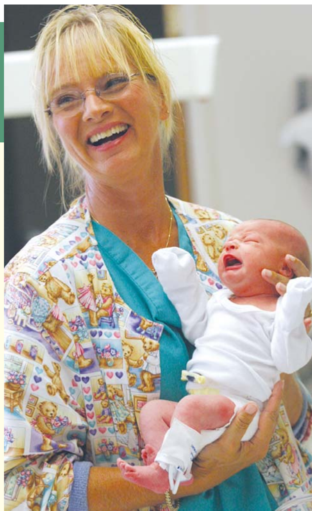
A newborn is welcomed into the world at Mercy Memorial Hospital System.

Healthy Monroe creates community-based healthcare benefits by bringing together local healthcare providers who have elected to join the Healthy Monroe network with NGS, a leader in the administration of self-funded healthcare benefits. Self-funded employers design their own benefits package and can customize healthcare benefits with Healthy Monroe to meet their specific employer needs and budgets. Employers also have the option to pair healthcare benefits with a health reimbursement arrangement (HRA) or health savings account (HSA).